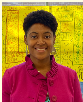
Mrs. Vessel Art