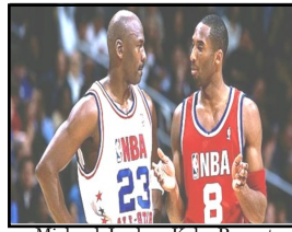
Michael Jordan; Kobe Bryant