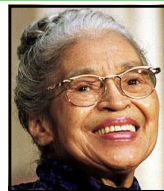
Rosa L. Parks