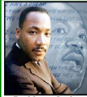
Dr. Martin Luther